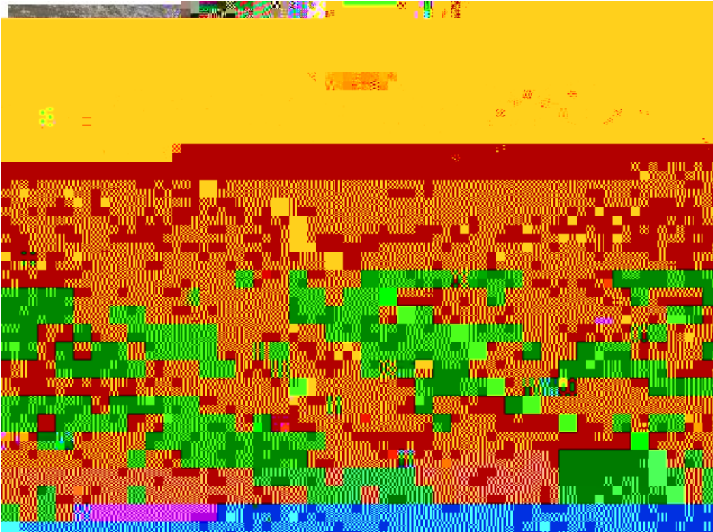
Visiting the penguins at Boulder Beach.