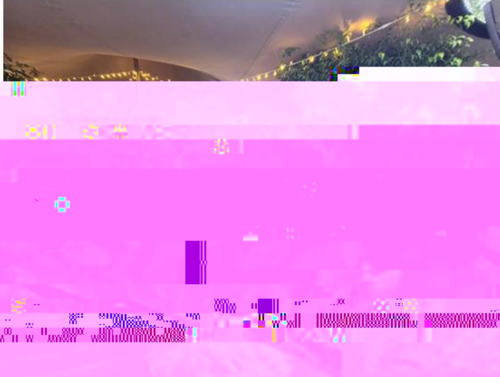
The courtyard at the restaurant where we celebrated the completion of our focus groups.